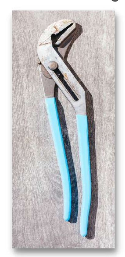
Tool Needed: Channel Lock (20 inches or larger)

If you have a Paramount or A&A Delta UV disconnect plumbing connection union with a channel lock (20 inches or larger) at the bottom of the UV like the photo below.